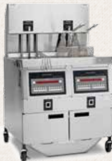
OEA-321-323 (Electric, Auto-Lift) OGA-321-323 (Gas, Auto-Lift)