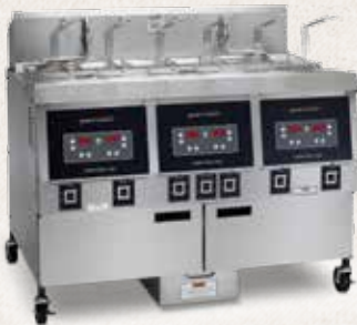
OFE-321-323 (Electric) OFG-321-323 (Gas)